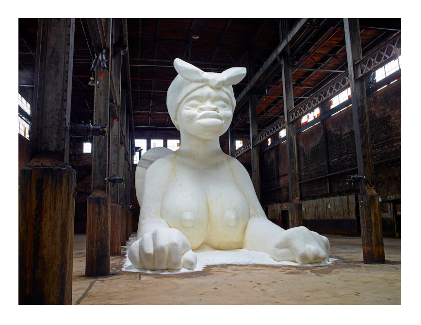
Kara Walker, A Subtlety, or the Marvelous Sugar Baby, an Homage to the unpaid and overworked Artisans who have refined our Sweet tastes from the cane fields to the Kitchens of the New World on the Occasion of the demolition of the Domino Sugar Refining Plant, 2014. Polystyrene foam, sugar. Approx. 35.5 x 26 x 75.5 feet (10.8 x 7.9 x 23 m). Installation view: Domino Sugar Refinery, A project of Creative Time, Brooklyn, NY, 2014.

Drawing on theories of the monstrous in French psychoanalysis and the Lacanian idea concerning filth as the constitution of the subject, Kristeva describes abjection as the dissolution of the distinction between the self and the "other." Kristeva herself associates the aesthetic experience of the abject with poetic catharsis. In her formulation, artists repair the trauma of disease and oppression by immersing themselves in the impure process of abjection in order to protect themselves from it.<sup>[3]</sup> More than a transgression of cleanliness, however, abjection is "what disturbs identity, system, order. What does not respect border, positions, rules." The nausea and physical recoil Kara Walker's A Subtlety produced at the site of an over-embodied sugar sphinx with the head of a mammy, breasts and buttocks exposed, is one example of this.