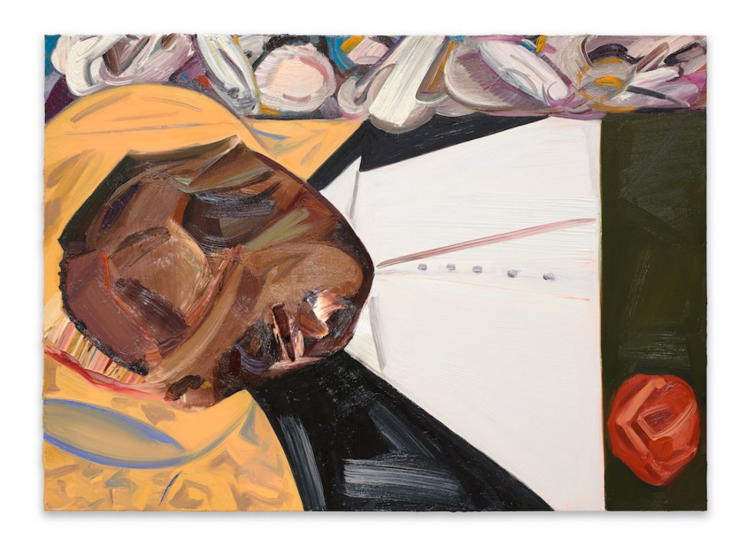
Dana Schutz, Open Casket, 2016. Oil on canvas. 38.5 x 53.25 inches. ©Dana Schutz. Image courtesy of the artist and Petzel, New York.

become passé. As a result, both exhibitions became litmus tests for measuring the corrosive effects of race relations in a putatively post-racial time. Schutz's painting in particular lay bare how power and privilege, opportunity and intention, continue to circumscribe art and its institutions, especially when it comes to the history of racial trauma in the U.S. Schutz is known for her large-scale paintings that border on the humorous and grotesque. In both impossible and contradictory situations, the figures in her paintings can be seen participating in violent or creative activities. The thematic trajectory of her practice makes her move to Till all the more puzzling. By picturing Till, Schutz claimed the events surrounding his murder and the images of his disfigured body that circulated in newspapers thereafter as shared historical memory. Alternately, for many Open Casket constitutes an act of cultural appropriation, another example of white interlopers taking on an aspect of African American life—specifically black death and pain—and using it for professional gain. For these reasons, the painting and its inflammation of a narrow brand of identity politics compel provocatively novel questions regarding the limits and ownership of the visual legacy of anti-blackness in the U.S.