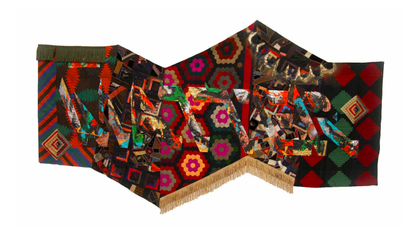
Sanford Biggers. Antique quilts, Oil stick, Spray paint, Acrylic Assorted, fabrics Glitter, Tar, Silkscreen. 120h \times 48w in.

unnamed victims of gun violence, the dismembered body was displayed on a pedestal in the gallery adjacent to the video.