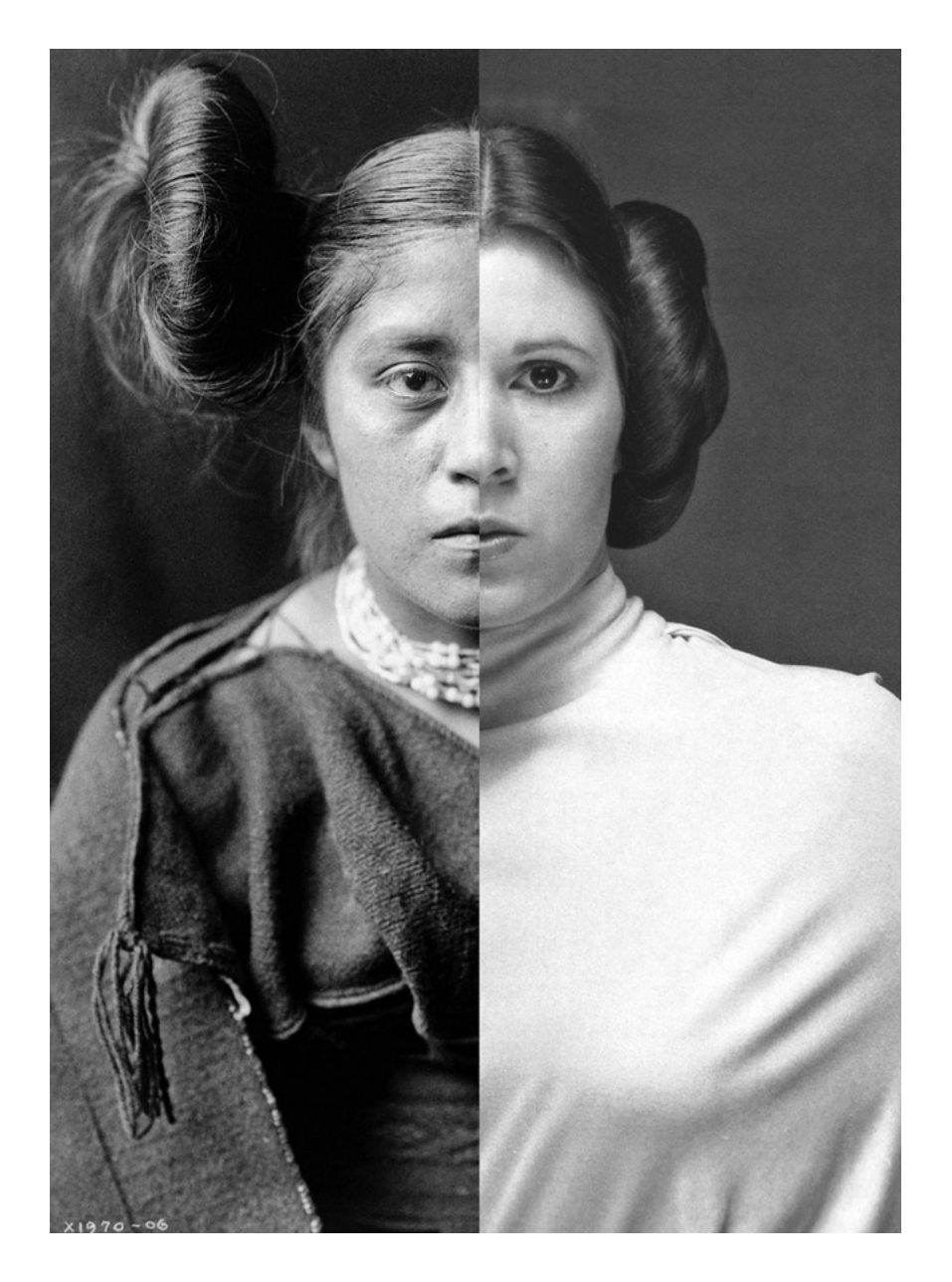
Figure 6: Nicholas Galanin, "Things are looking Native, but Native's looking whiter," (2012).

For example, Nep Sidhu's Confirmation series (A, B, C, with A and B as figures 2 and 3), is a set of images wherein Sidhu creates what he names a "third space, a space between the practice of writing and the practice of architecture."[7] Sidhu uses the ancient Arabic calligraphy script, Kufic, to relay messages within this series. Sidhu has commented that Confirmation A is supposed to represent the transition from the linguistic to Confirmation B's transition to the architectural. In an exhibition catalogue of this work for Sidhu's first solo show, just outside of Vancouver, British Columbia at the Surrey Art Gallery in 2016, the Confirmation series is described as such: