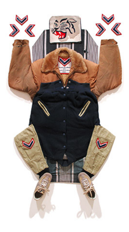
Figure 4: Maikoiyo Alley-Barnes, Wait! Wait! Don't Shoot (An Incantation for Jazz and Trayvon Martin), 2014.