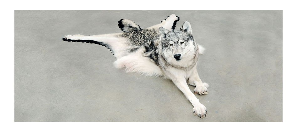
Figure 5: Nicholas Galanin, Inert, 2009.

various manifestations, offerings that are simultaneously full of divine beauty and reflective of worldly trouble: this is work out of this world and very much of this world. Indebted to histories and creators of new horizons, Black Constellation bestows art and practice for the Black, Brown, Indigenous, Subaltern; for those relations of the South-South, the internationalist, the native, the immigrant, the alien—those displaced from and without a home. In such a configuration, they constellate two worlds: one, a world sedimented out of histories of chattel slavery, colonial violence, imperialist wars, land dispossession, police violence, environmental degradation, forced migration, and resource extraction—all of the world's old and new violations against its Black and Brown peoples; a second, an alternative, other-world, a vision that sees the present for what it is and constructs the future as a necessary inversion. Black Constellation is of an AfroFuturist sensibility, one that arrives as alien under conditions of alienation. In the face of such nods, forward and backward, historically and futuristically, the collective remains steadfastly in the present.